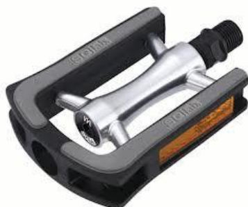
Normal pedals (Footie). No cleats are required