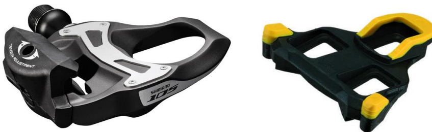
SPD-SL Shimano Pedaling System for road racing bikes