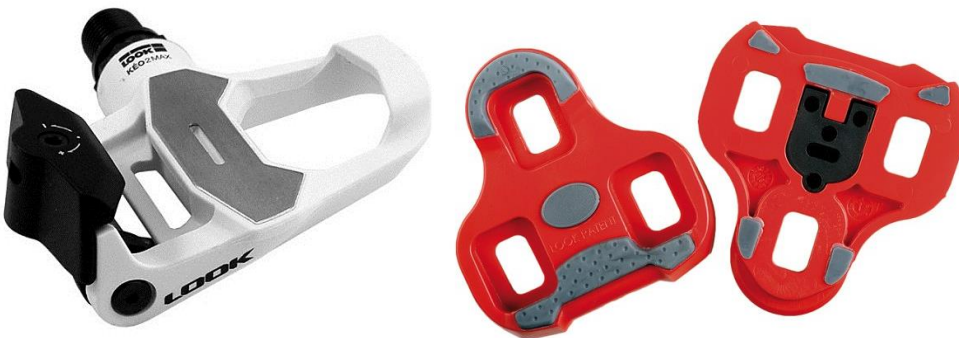
Look Kéo Pedaling System for road racing bikes. Former system is incompatible (before 2004)